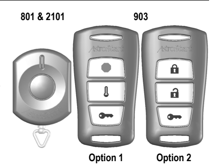
TABLE OF COMMANDS

Remote(s) \ included \ in \ kit \ may \ differ \ from \ the \ ones \ illustrated.